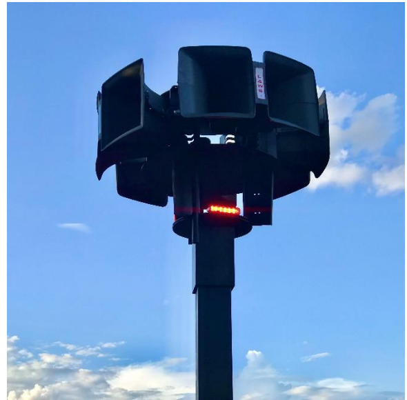
Optional Low-Profile Speakers